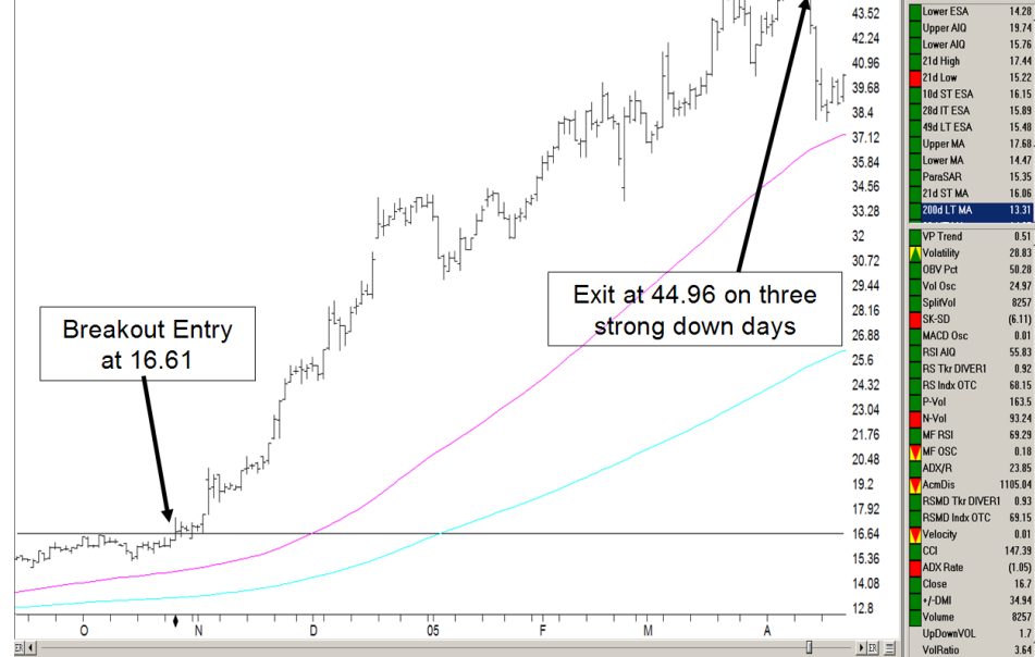
Figure 2. Daily chart of Walter Industries. Arrows show entry and exit for trade based on Rockets

strategy that resulted in 170.7% profit. Position was taken when price crossed horizontal trendline.